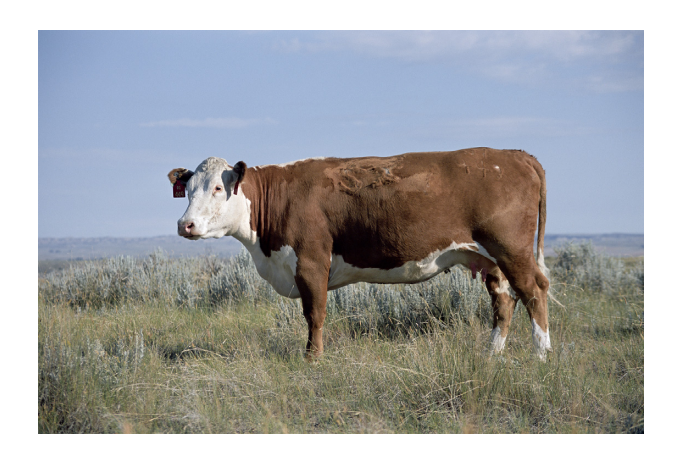
Figure 1: L1 Dominette 0 1449. The line-bred Hereford cow was selected as the original cattle reference animal for her high level of inbreeding.

The original Hereford assembly used blood as the source of DNA, leading to difficulties in assembling specific genomic regions